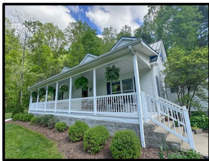
Guest House today