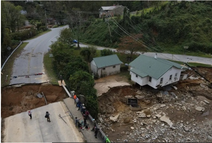
Bat Cave after Hurricane Helene