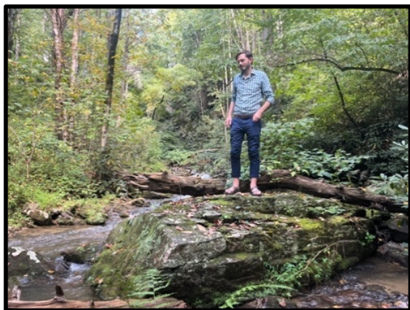
Broad River on the property of the Community of the Transfiguration in Bat Cave.