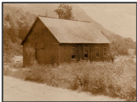
Church and school built in 1900 on the Bat Cave property