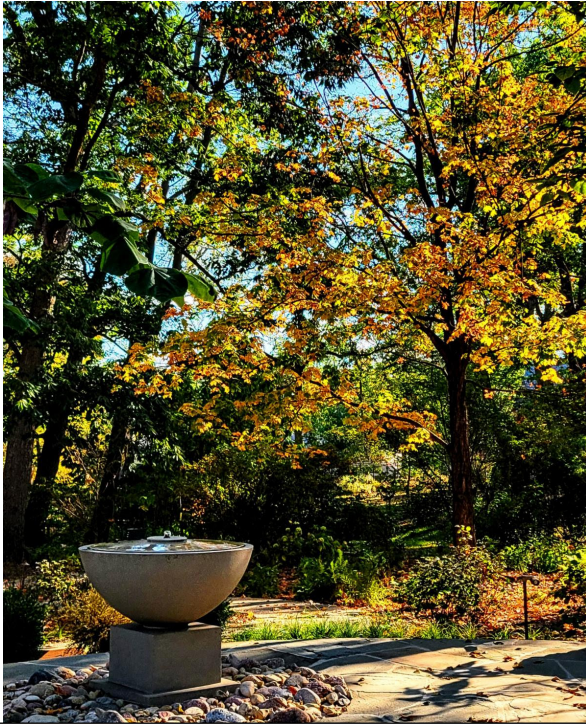
Fall colors on the property of Community of the Transfiguration